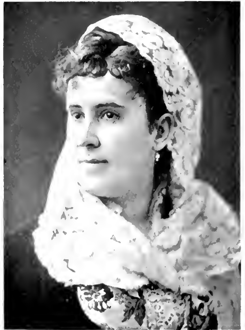
CLARA LOUISE KELLOGG.